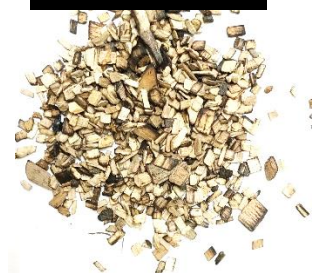
Small Wood Chips

Note: - Take extra care to minimise dropping any of the chipping in the gap / Glass retaining channel at the front of the fire.