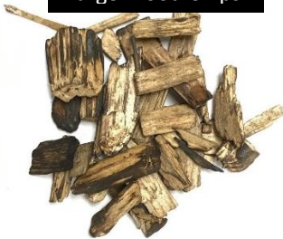
Large Wood Chips

Carefully add the "Small wood chips" ( 17 ) around the edges of the fuel bed.