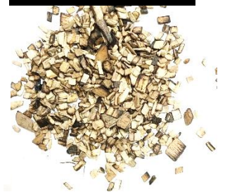
Small Wood Chips

Note: - Take extra care to minimise dropping any of the chipping in the gap / Glass retaining channel at the front of the fire.