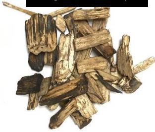
Large Wood Chips

Carefully add the "Small wood chips" (21) around the edges of the fuel bed.